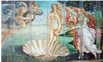
with special treatment