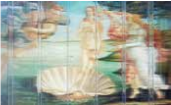
without special treatment

Exolon Group offers a complete portfolio of polycarbonate multiwall sheets to meet the most diverse needs. If meant to serve as partition walls, sheets should have a thickness of less than 16 mm in order to ensure that the structure is adequately lightweight. All sheets are available in a selection of colours (opal, bronze, blue, green) to fit with a range of design schemes.